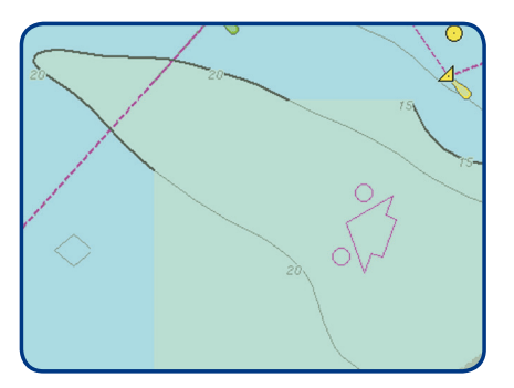
Mismatch in contour intervals